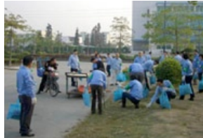
Casio Electronic Technology (Zhongshan) Co., Ltd.

The Casio Group carries out periodic cleanup campaigns conducted by employee volunteers around the business offices and plants at all of its companies in Japan. Casio will continue to carry out these periodic cleanup campaigns that contribute to local communities.