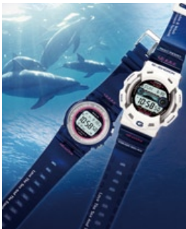
"International Dolphin & Whale Eco-Research Network" model

In 1994, we began selling "G-SHOCK" and "Baby-G" watch models in co-sponsorship with the 4th International Dolphin & Whale Conference held in Japan. By donating a portion of the proceeds from sales of