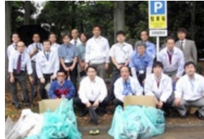
Casio Computer Hamura R&D Center