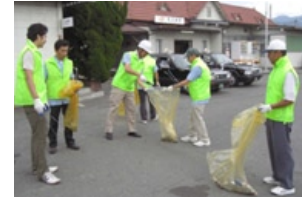
Kofu Casio Co., Ltd.