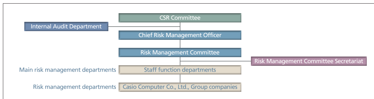
Risk management system

The Internal Audit Department’s audits into management systems are conducted independently from the risk management activities of the Company.