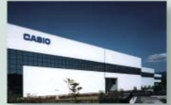
Kochi Casio Co., Ltd.

The Casio Group is undertaking various measures to help prevent further global warming. Thirteen Casio Group companies participated in "Team Minus 6%," a national campaign under the supervision of the Global Environment Bureau of the Ministry of the Environment to reduce carbon dioxide emissions. Among these firms, Kochi Casio Co., Ltd. discontinued the use of nitrogen trifluoride (NF 3 ), a prominent greenhouse gas, in March 2005. As an environmental action target, we aim to reduce total emissions of greenhouse gases other than CO 2 in 2010 to below the 2000 level.