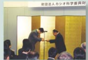
Presentation of funding at the Casio Science Promotion Foundation

The Casio Science Promotion Foundation has been one of the Company's major avenues of social contribution for the past 25 years. Each year, the Company provides financial support for scientific research into next-generation technologies. Casio also provides support for the "Kids ISO Program," an environmental education support program developed for children, which encourages them to make environmental improvement activities part of their daily lives. In addition to providing support for environmental education in elementary schools, Kofu Casio Co., Ltd. offers elementary school students guided tours of its manufacturing plants and other facilities. Students hear stories about the founding of Casio and receive an explanation of the Company's current environmental activities. They also get a chance to try their hand at assembling a calculator.