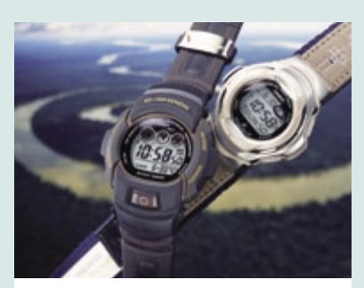
Part of the revenues from the sale of watches is used to protect the Amazon rainforests