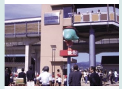
A large radio-controlled clock at Gomenmachi Station, in Kochi Prefecture. The clock was donated by Casio Computer Co., Ltd. and Kochi Casio Co., Ltd.