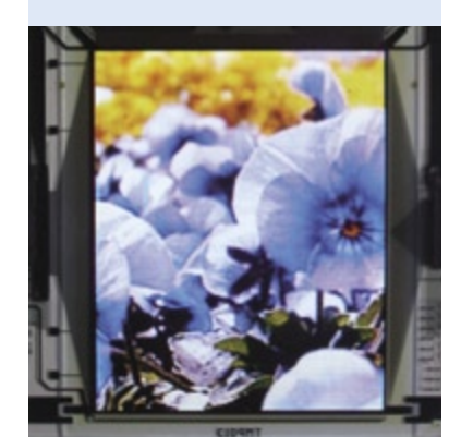
An OEL display (pilot model)