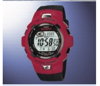
Paying for purchases at a store with an Offica™ watch (Top) G-Shock GWS-900, compatible with "Speedpass" settlement system (Bottom)